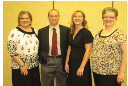
Staff of Walters Gardens, Inc.

Walters Gardens, Inc. was selected in part due to their commitment to the entire purchasing process.